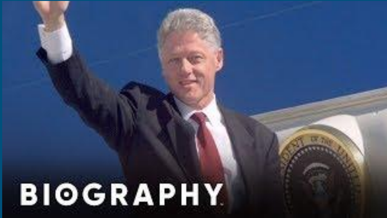
Biography- Bill Clinton