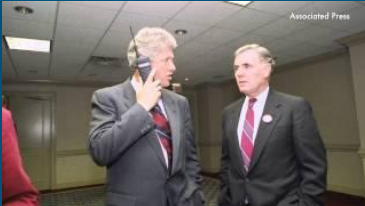
A Brief History of the Cell Phone