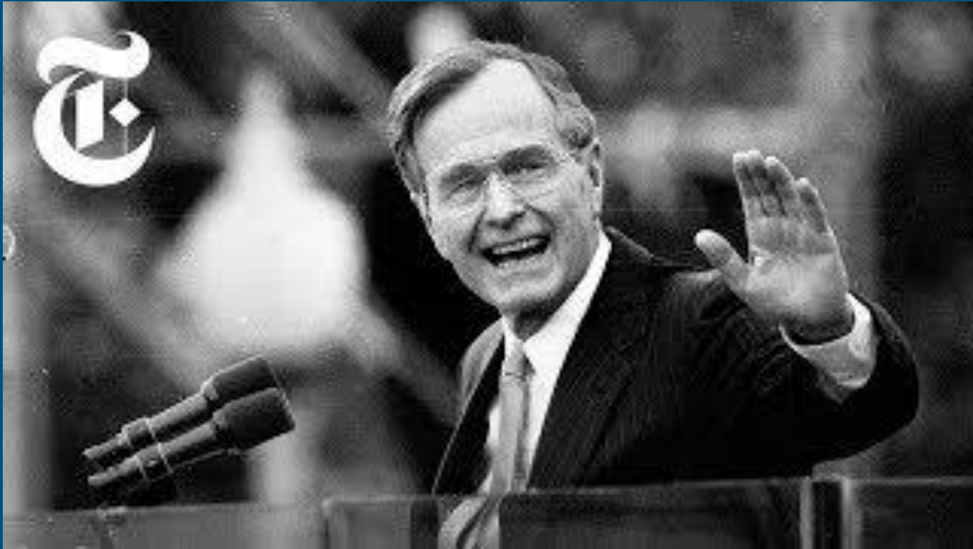
Remembering George H.W. Bush