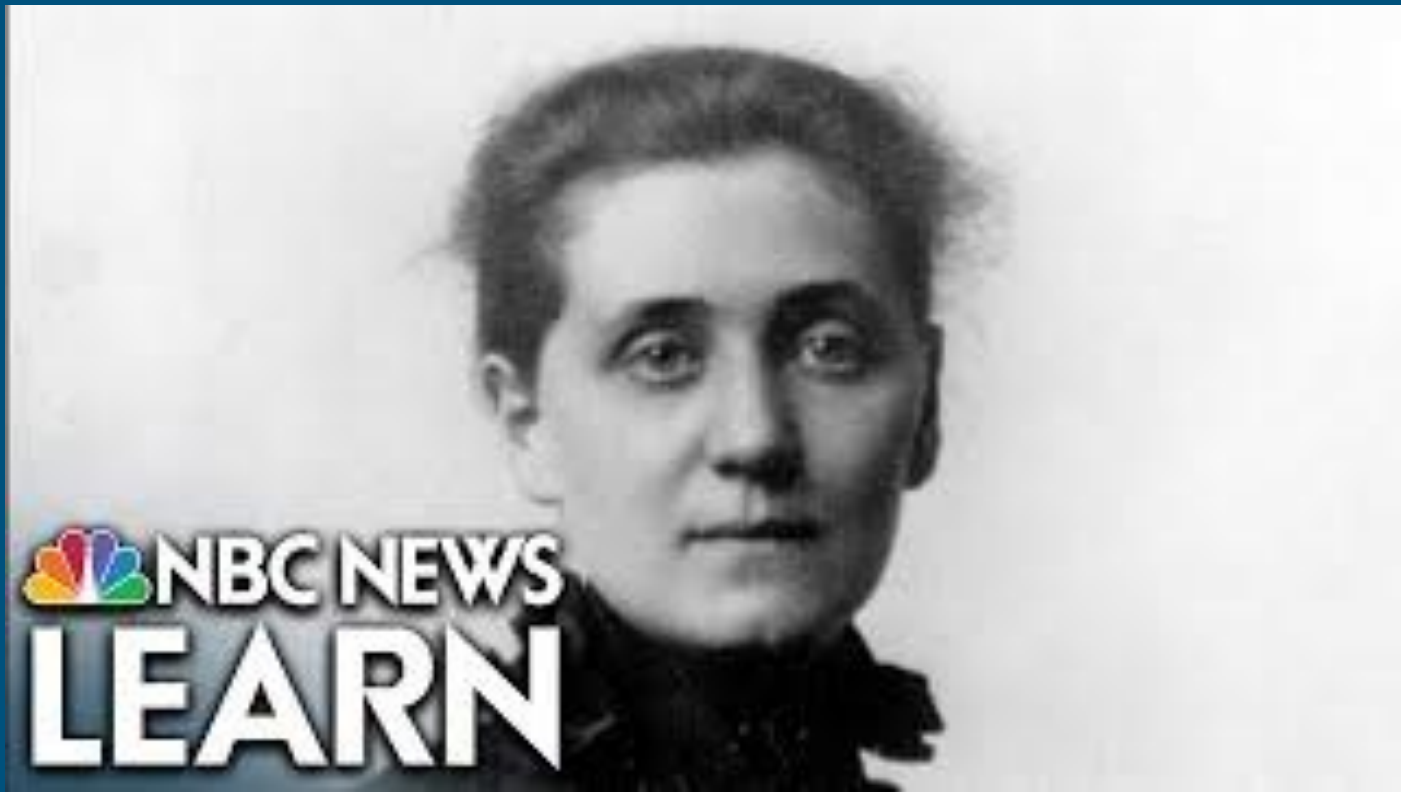
Jane Addams and the Hull House