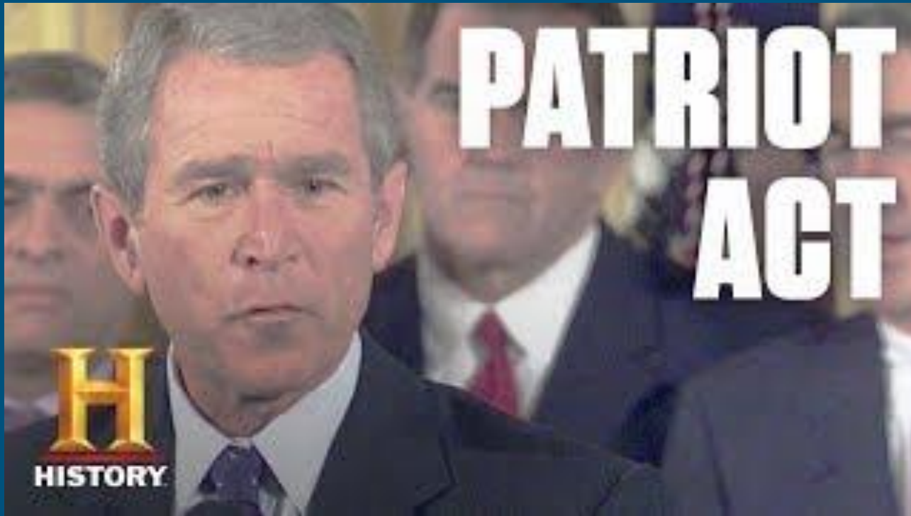
The Patriot Act