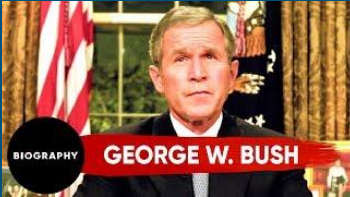
George W. Bush- BIO