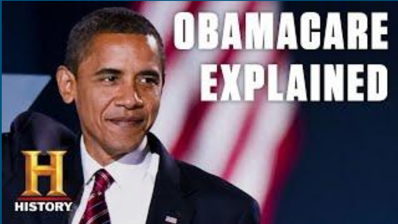
The Affordable Care Act