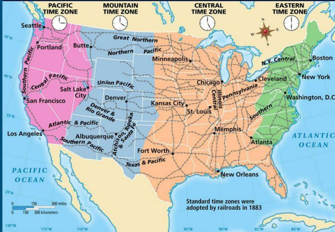
Map of Transcontinental Railroads- 1865-1900