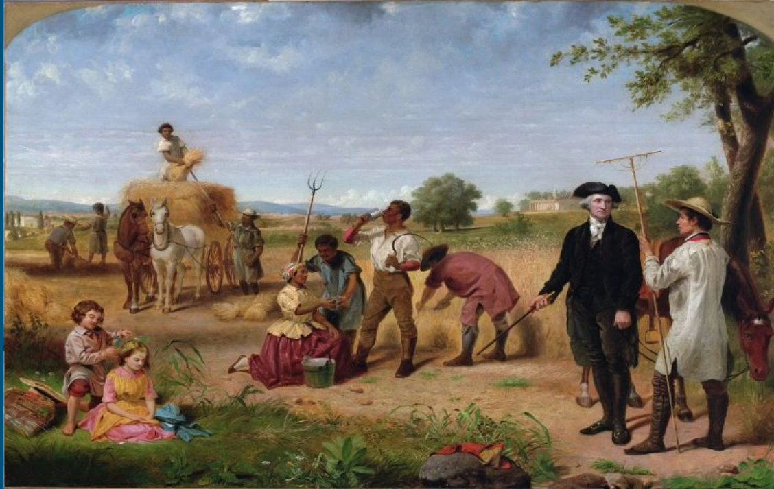
George Washington as a Colonial Farmer at Mount Vernon