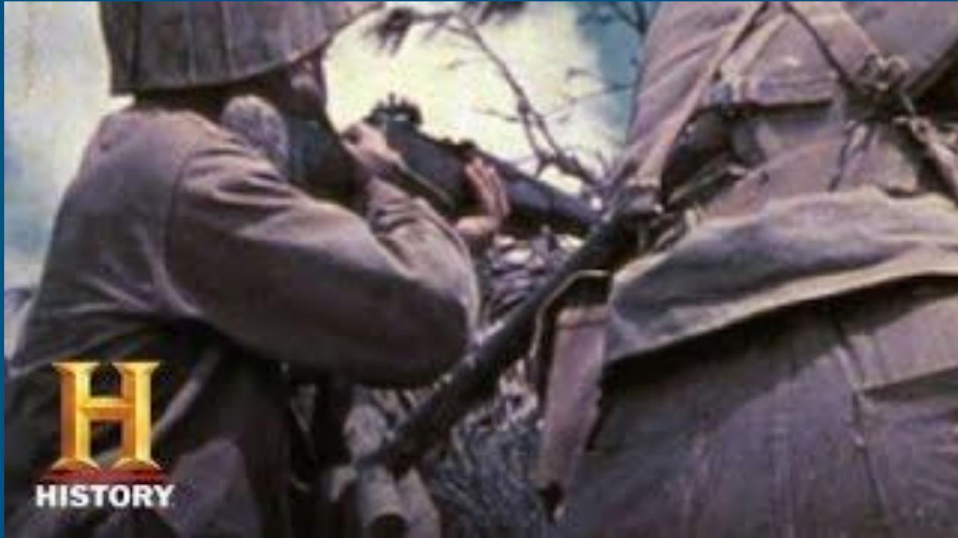
Okinawa- The History Channel