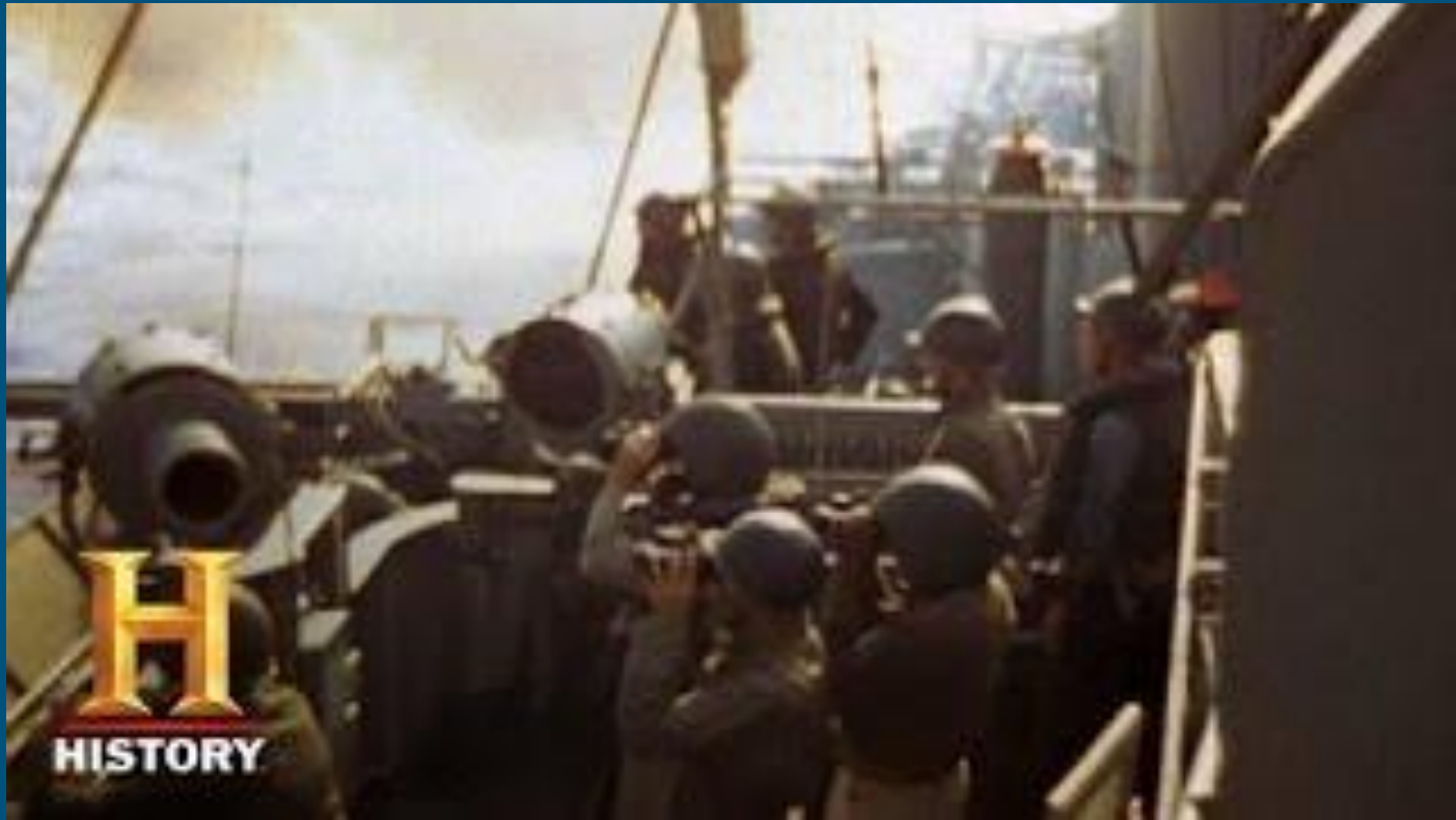
Iwo Jima- The History Channel