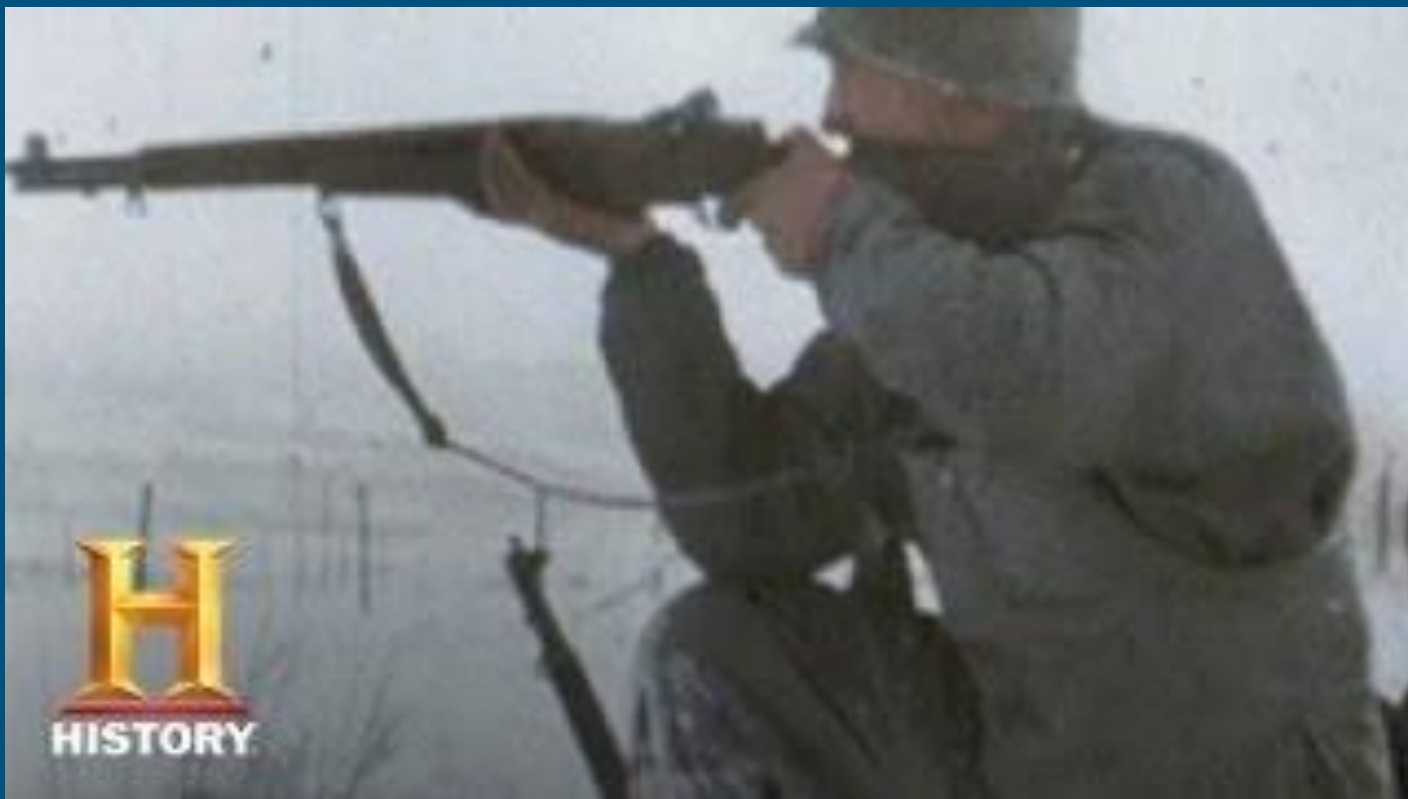
The Battle of the Bulge- The History Channel