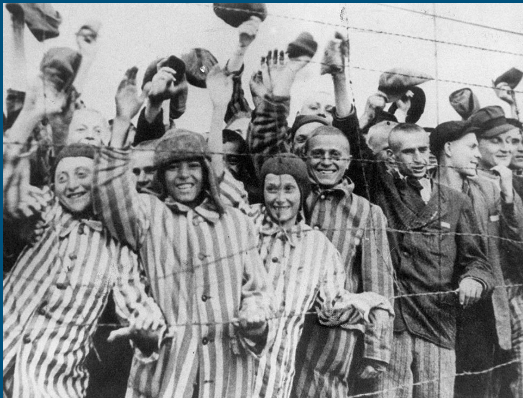
The Holocaust- Image