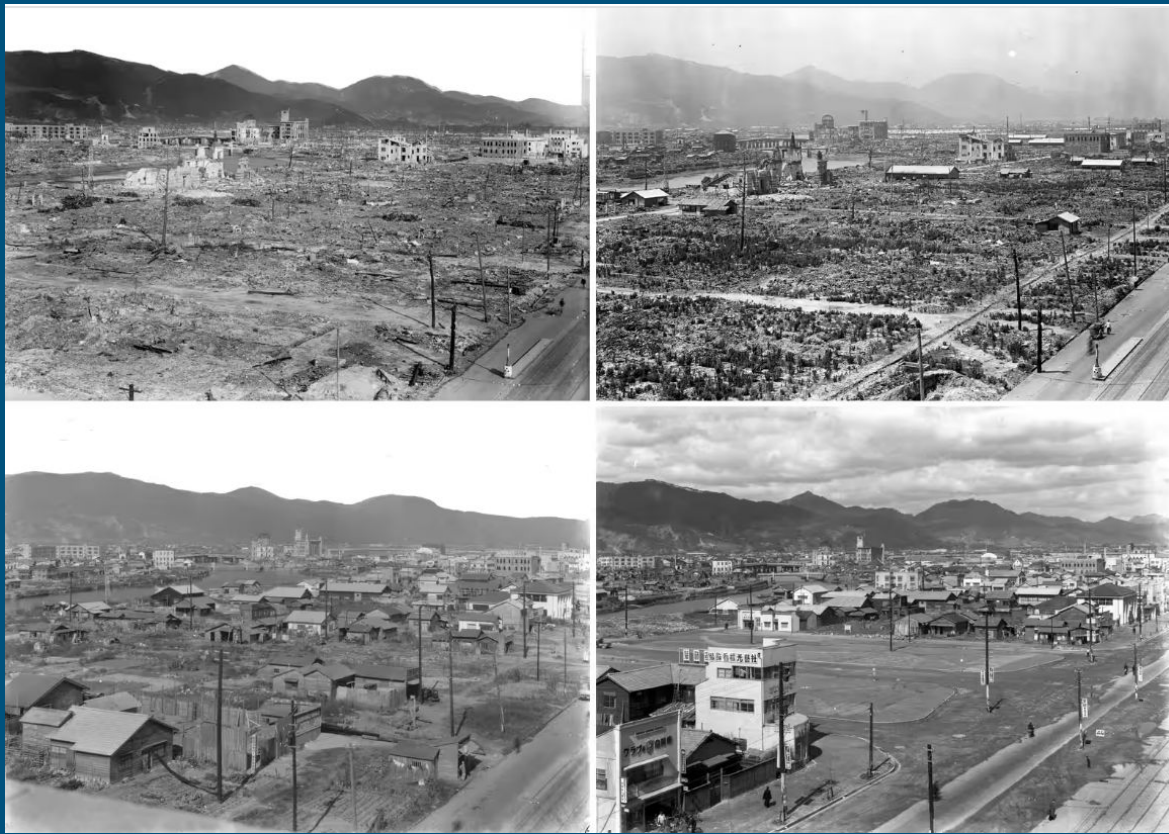
Hiroshima- Before & After the Atomic Bomb (1945)