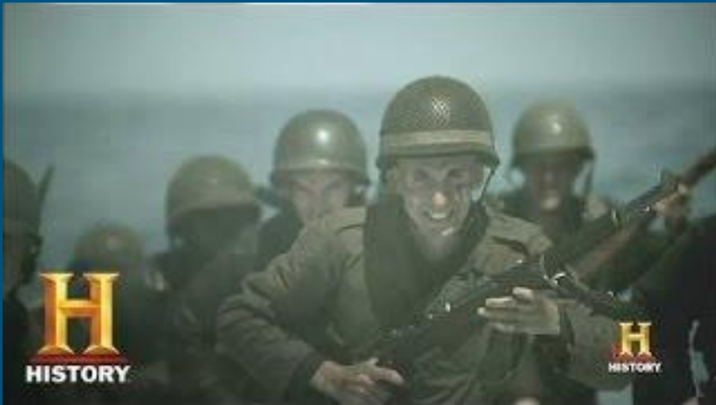
America: The Story US- D-Day (The History Channel)