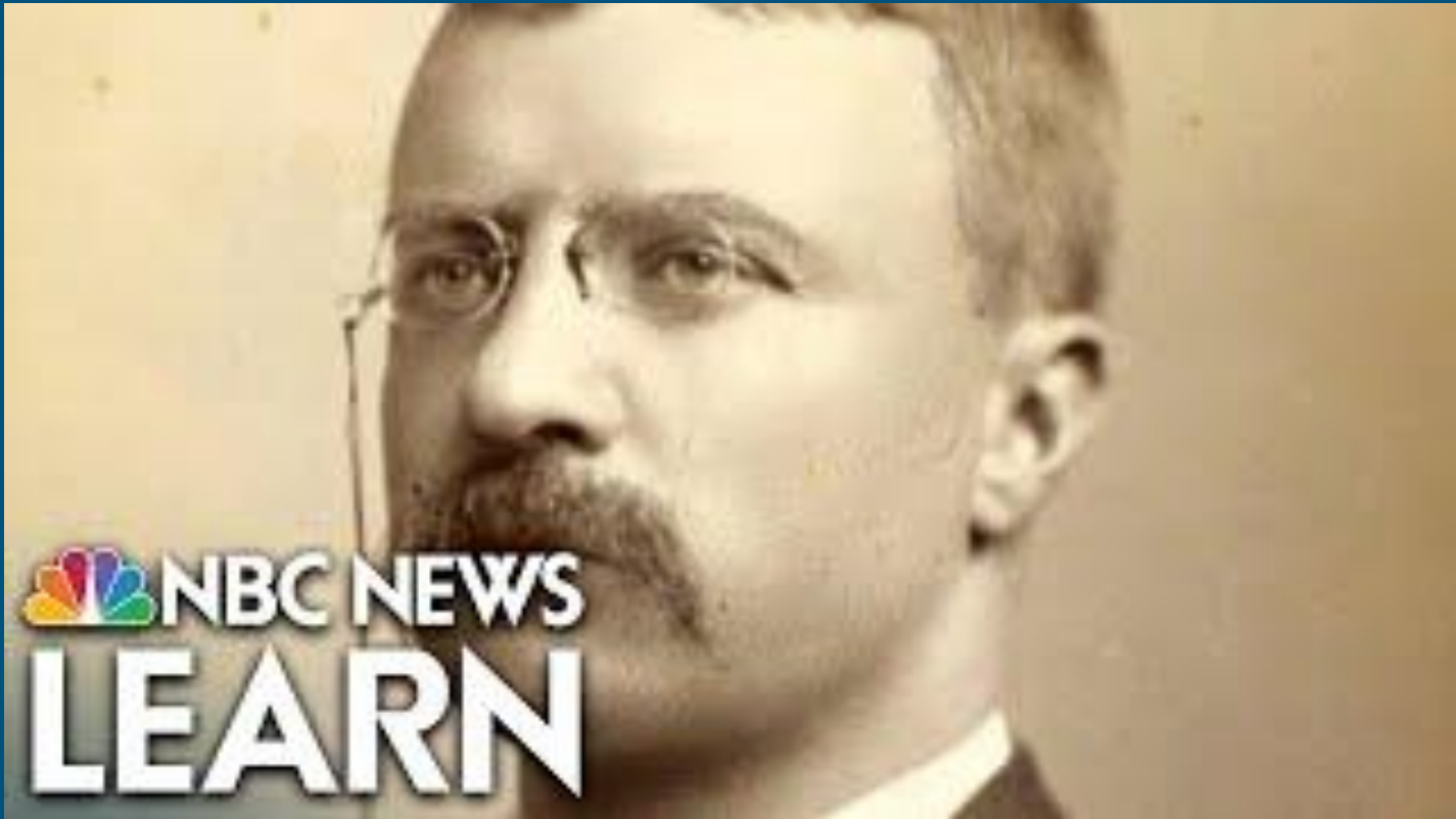
Theodore Roosevelt Pushes for Expansion, 1901