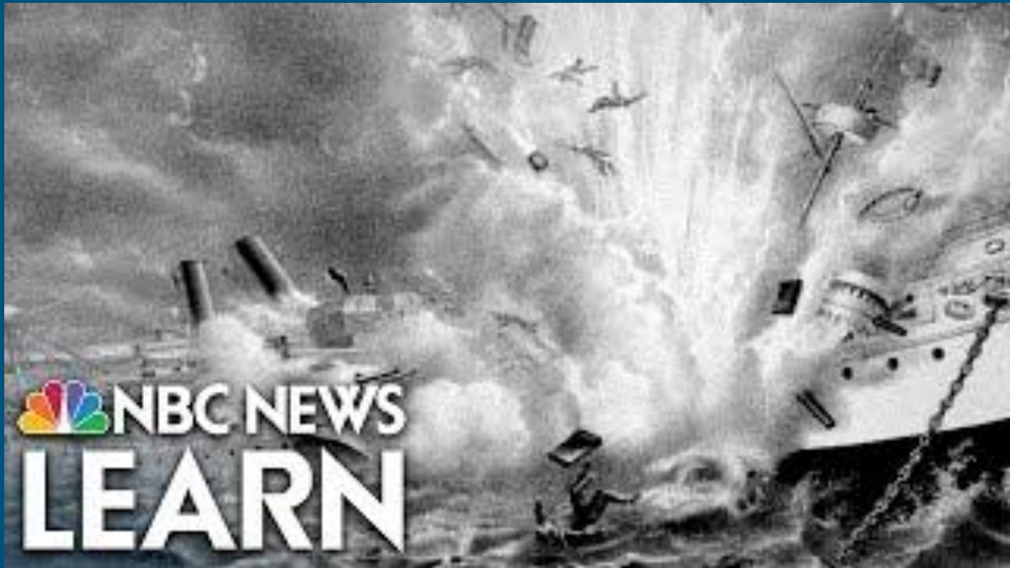
The Spanish-American War, 1898