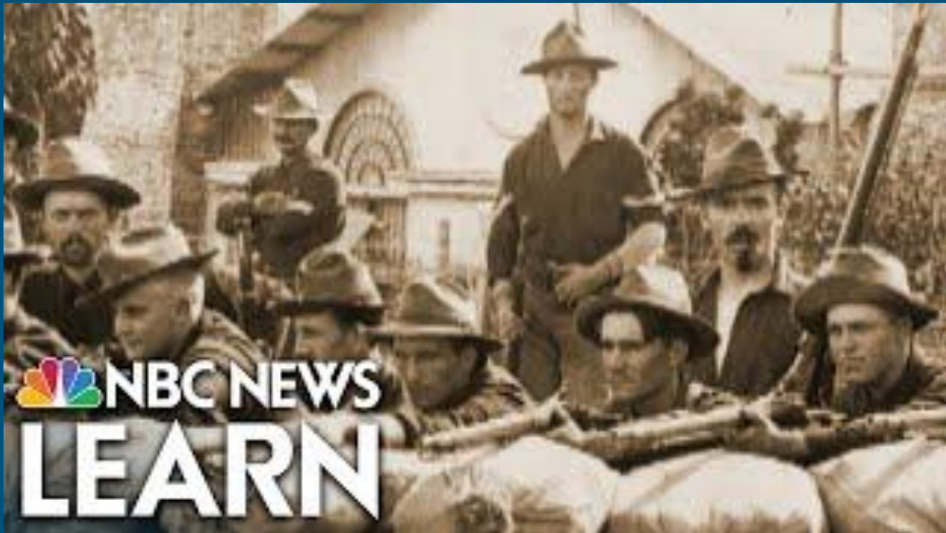
Resistance to American Imperialism in the Philippines, 1902 (NBC News Learn)