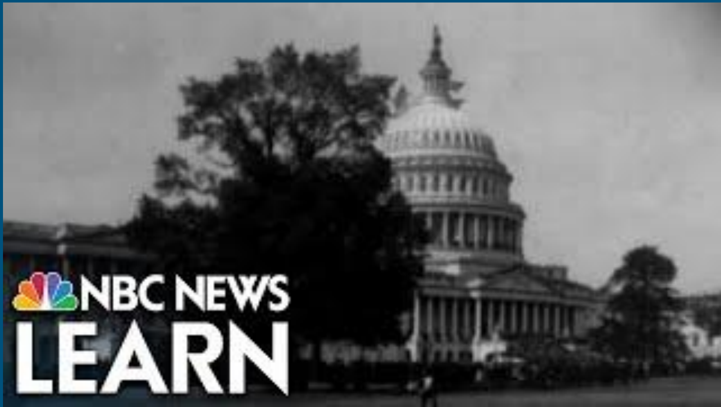
The Hawaiian Revolution of 1893 (NBC News Learn)