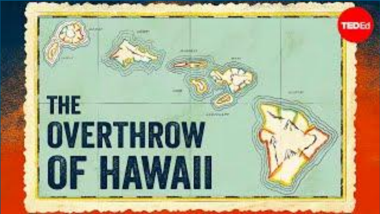
The Dark History of the Overthrow of Hawaii, 1893 (TED)