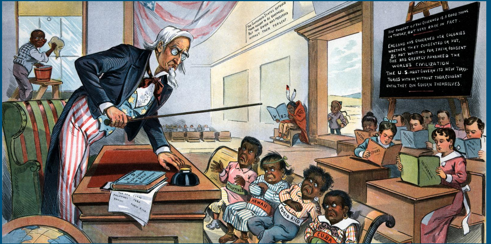
School Begins! January 25, 1899- Puck Magazine